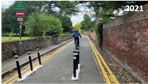
Trinity Road "quietway", Marlow Trial 'quietway' introduced on Trinity Road, using decorative planters and bollards. Residential / business access maintained. Made permanent in 2022.