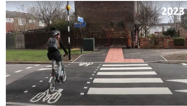
Platinum Way Upgrades to former Emerald Way Gemstone route, via Prebendal Farm and Fairford Leys, incorporating the Haydon Hill link Winner – Buckinghamshire Design Award (Transport & travel category)