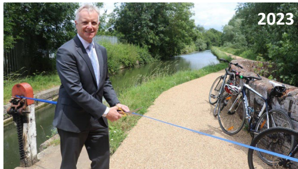
Aylesbury Canal Towpath Extension, width and surfacing upgrades to the Grand Union Canal towpath between Aylesbury town centre and Kingsbrook