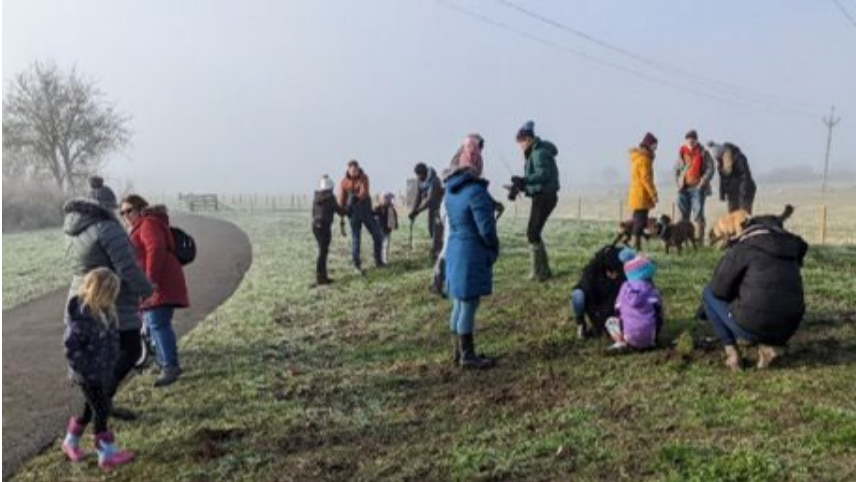
St Peter's Greenway