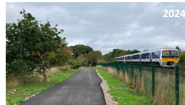
Misbourne Greenway 4km link between Wendover Dean and Great Missenden, being delivered by Sustrans with partners. Second phase of the Buckinghamshire Greenway. Opening later this year.