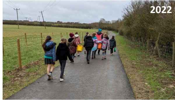
St Peter's Greenway 1.7km link connecting Berryfields and Buckingham Park, Aylesbury