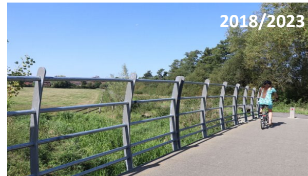
Waddesdon Greenway & School Link 4km Waddesdon Greenway connecting Aylesbury Vale Parkway station & Waddesdon Manor, extended to connect with Waddesdon schools and village